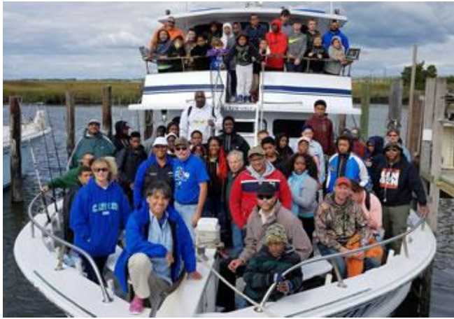
Charter fishing on the Bonanza II with NJ HOFNOD teams from Sussex, Union, Cumberland and Passaic counties.