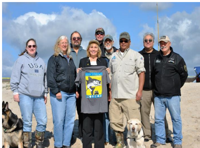
Some of the veterans attending this year's GSFT

The NJDEP's sixth annual NJ WILD Outdoor Expo will be held Saturday and Sunday, September 10-11, at the Colliers Mills Wildlife Management Area in Jackson Township from 10 a.m. to 5 p.m. each day, rain or shine. Admission and parking are free. All activities are free, with the exception of a $3 fee to use the climbing wall. For more information, visit the website . This fun-filled family event is designed for visitors to discover new ways to appreciate and enjoy New Jersey's great outdoors. Participants have an opportunity to try a broad spectrum of outdoor activities such as fishing, kayaking, hiking, shooting sports, rock climbing, camping skills, geocaching and wildlife watching. Demonstrations of sporting and tracking dogs, historical re-enactments, SCUBA dives, turkey calling, nature photography and much more await.